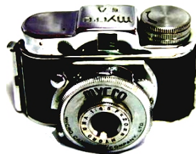
1948 Mycro I model

Mycro camera and leather case. Fixed focus two-element 20mm f/4.5 Una lens, with continuous apertures to f/11. Small size (2" x 1-1/4" x 1-1/4".) Pull-down shutter lever which can be activated by a thread or trip wire. Size 00 roll film, 14 x 14mm format, on un-perforated 17.5mm film. Made in Japan before, during and after WWII by Sanwa, the Mycro was a subminiature camera which really worked. It took 10 pictures of 14mm x 14mm on 17mm wide film. Upon the camera's arrival, I was able to determine this is the Mycro I-model from 1948 made in occupied Japan.