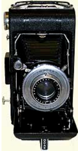
Kodak Vigilant Six-20