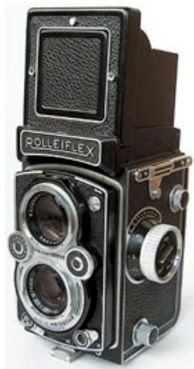
Rolleiflex 3.5a MX

Rolleiflex Automat Type 4 (MX), Ser. # 1226507. 3.5 a 75 mm f 3.5 (June, 1951-March, 1954), TLR, 120 roll film, case, Bayonet 1 lens cap. Legendary Rollei twin lens reflex. Ser. # 1226507. Lens serials: Viewing: Heidesmat # 508224, Taking: Schneider # 2794319.