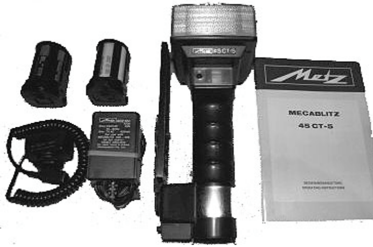
Metz Mecablitz 45 CT-5 Flash and Accessories